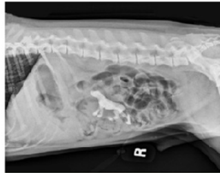
X-ray of a dog that had swallowed a toy plastic jaguar

For more information on each of these services and their